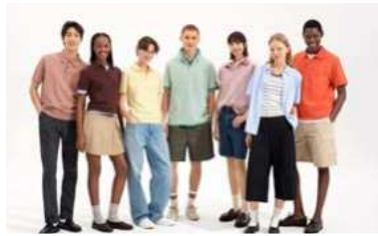
Lifewear essentials designed for comfort, quality and longevity

staples, UNIQLO offers even more versatile options to elevate your warm-weather 'fits. Linen remains a timeless favorite: lightweight, breathable and effortlessly refined. Polos strike that perfect balance between relaxed and polished, while shorts deliver all-day comfort without compromising on style. Mix and match these essentials, and you've got endless outfit combinations that transition seamlessly from laid-back to put-together with hardly any effort.