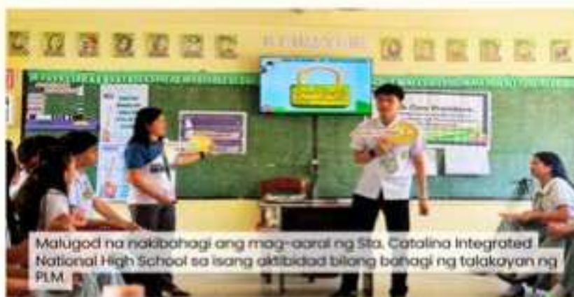
Malugod na nakibahagi ang mag-aaral ng Sta. Catalina Integrated National High School sa isang aktibidad bilang bahagi ng talakayan ng PLM.

Lubos ang pasasalamat ng PhilHealth sa mga school administrators, guro, at mga mag-aaral na naging bahagi ng matagumpay na gawaing ito upang palakasin ang kamalayan ng mga mag-aaral tungkol sa PhilHealth.