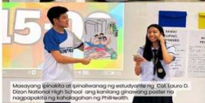
Masayang ipinakita at ipinaliwanag ng estudyante ng Col. Lauro D. Dixon National High School ang kanilang ginawang poster na nagpapakita ng kahalagahan ng PhilHealth.