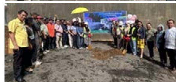
CARD MRI staff, management, clients and partners took part in the groundbreaking of the CARD Care Clinic facilities in Marawi City (left) and Cotabato City (right), marking a significant move toward bringing accessible primary healthcare to the communities.

CARD MRI Property Management, Inc. (CMPMI) led the groundbreaking ceremonies for the CARD Care Clinic Inc. (CCCI) facilities in Marawi City and Cotabato City on January 12–13, 2026. The project represents a major step toward expanding access to primary healthcare for underserved communities in Mindanao, reflecting CARD Mutually Reinforcing Institution's (CARD MRI) commitment to holistic community de-