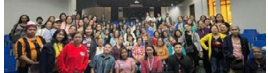
February 9, 2026 | Bay, Laguna — The Department of Trade and Industry (DTI)-Laguna, in partnership with the Center for Agriculture and Rural Development—Mutually Reinforcing Institutions (CARD-MRI), successfully conducted a Livelihood