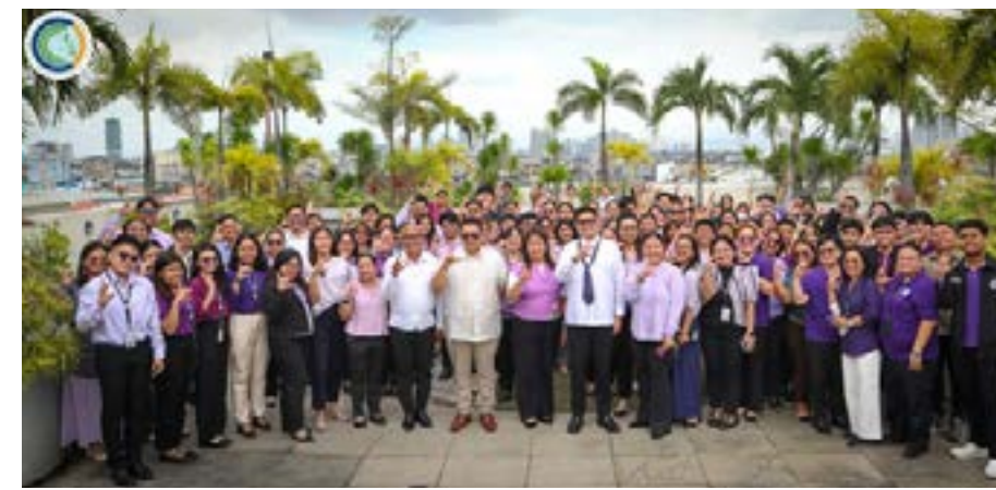
Officials and employees of the Climate Change Commission joining the celebration of National Women's Month activities

the nation is strongest when the voices of those most vulnerable are heard and represented. The leadership of Filipinas, they said, is essential for building a climate-resilient and inclusive future—because those who truly understand the struggles on the ground are the ones best positioned to provide real and effective solutions.