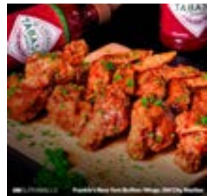
This is your chance to dig in until you drop.

For all our buffalo wings stans, the first-in-Bulacan Frankie's New York Buffalo Wings at the West Wing of SM City Marilao brings its iconic variations to the table, with flavors ranging from classic buffalo to garlic parmesan and honey sriracha. Craving wings?