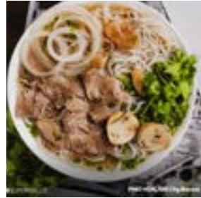
is the perfect spot to savor the familiar flavors of the country.

A fan of Vietnamese classics? The soon-to-open, first-in-Cavite Pho Hoa at the Upper Ground Level of SM City Bacoor serves soulful bowls of pho, alongside staple sides like spring rolls, vermicelli bowls, and flavorful rice plates. With meals that'll remind you of your last trip to Vietnam, Pho Hoa